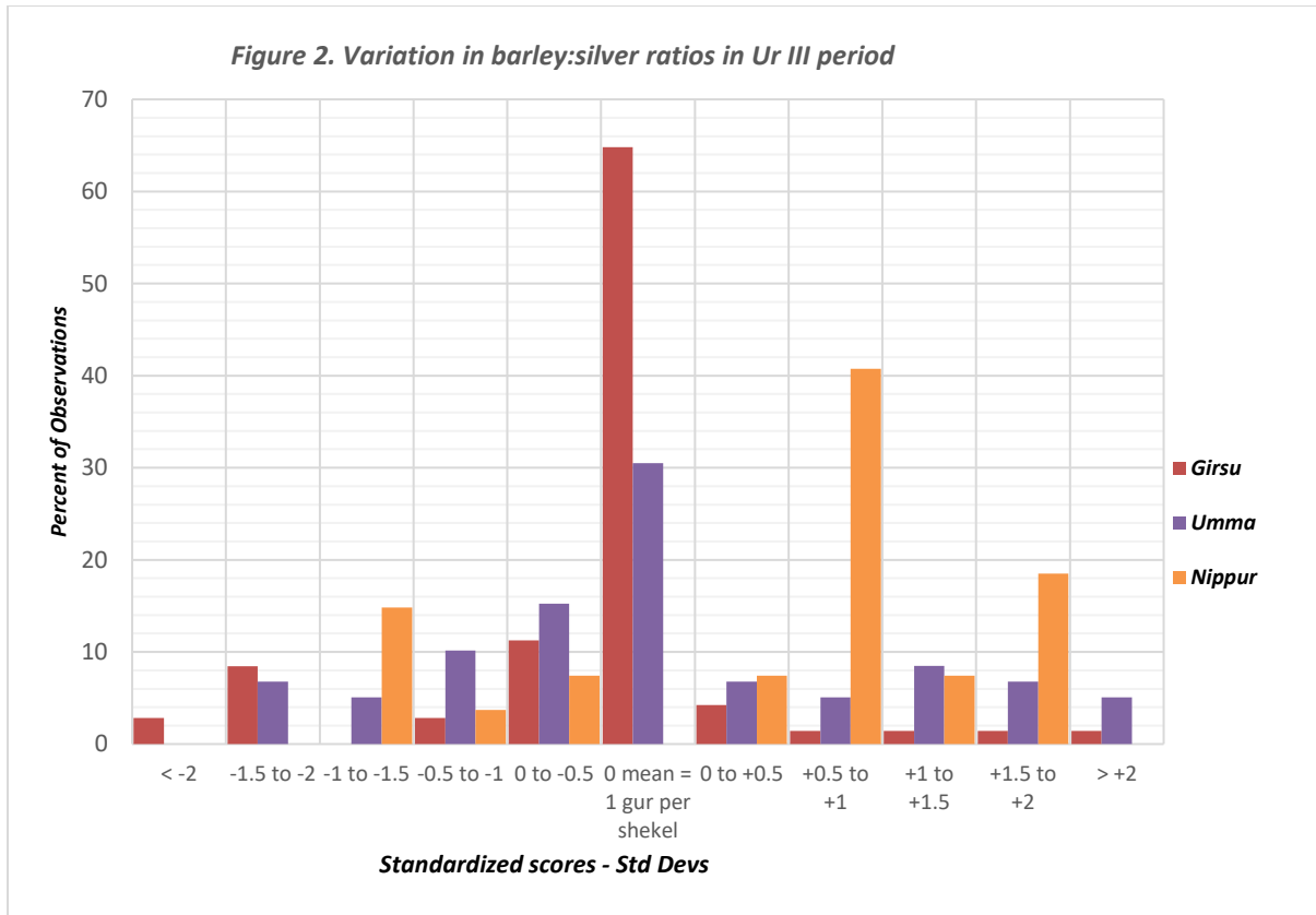
Figure 2. Variation in barley:silver ratios in Ur III period

An equivalency of 300 sila 3 of barley per shekel of silver is also largely supported by the accounts detailed in Table 3. For the most part, these are accounts of allocations or “expenditures” from barley assets of the provincial institutions for a wide variety of purposes including the payment of taxes, interest on barley loans and field rents. Eight out of ten of the texts originate from Girsu and two are from Umma. Six out of ten record a barley to silver equivalency of 300 sila 3 per shekel including one of the Umma texts. However, the remaining four texts indicate more variability in the barley:silver ratio, for which in most cases it is difficult to offer an explanation.