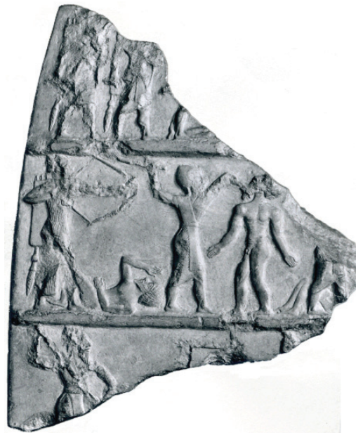
Figure 3. Bow, mace and spear in fighting scenes of the Akkadian period (stela fragment from Girsu. Louvre Museum, AO 2876; from Abrahams and Battini 2008: p. 104).

§6.4. Who supplied the weapons? With regard to conscripts ( erin 2 ), we cannot be sure that it was always the central power. Professional soldiers ( aga 3 - us 2 ), in contrast, were certainly armed by the royal administration, as evidenced for example by this interesting text from Drehem, dated 2/xi/AS 2: